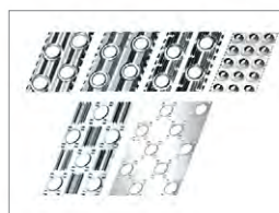
Various Fin Patterns